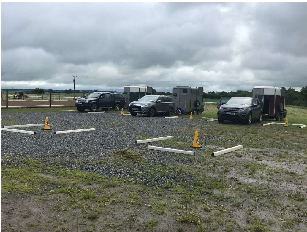
Cars and boxes will face each other with centre lane used to drive away – right hand side