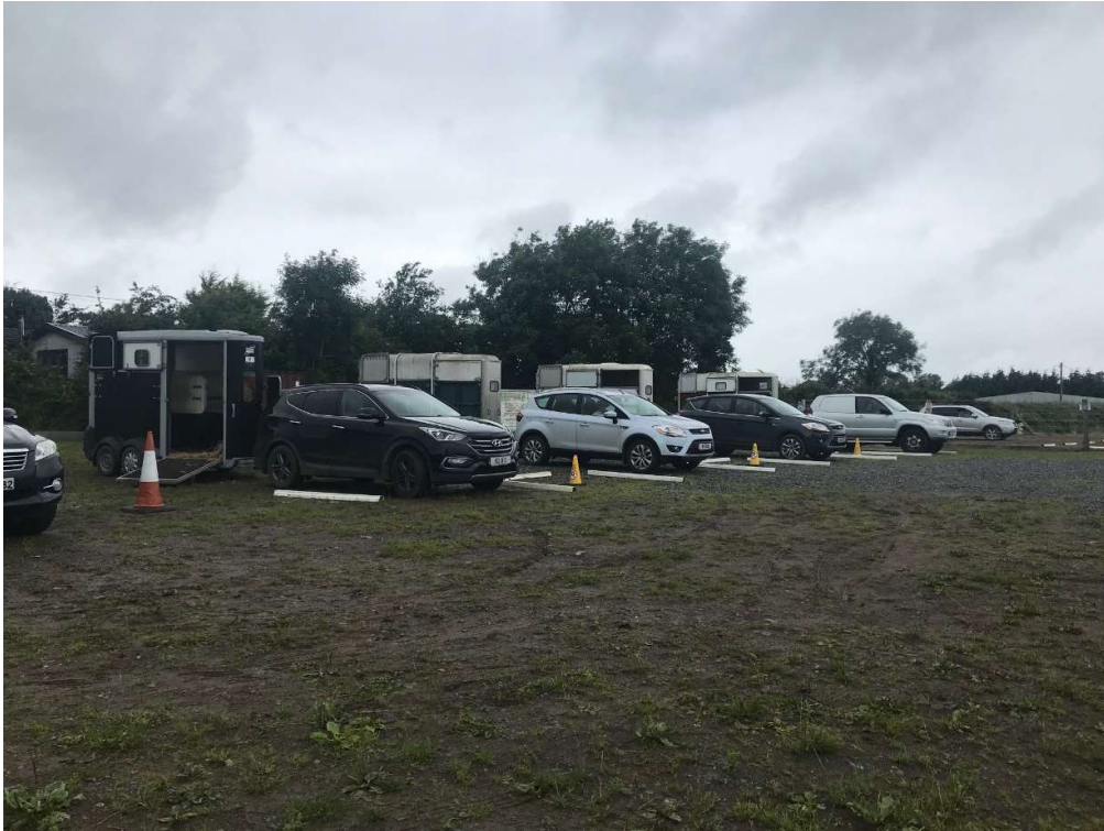
Vehicles parked in left hand lane observing 5m separation between vehicles.