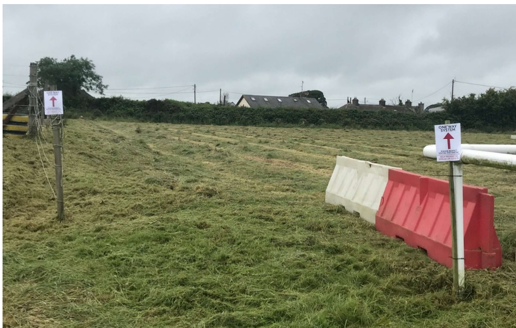
One way system entrance to sand arena