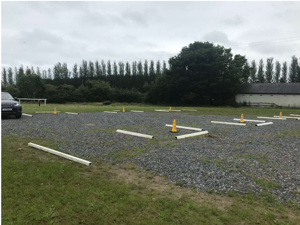
Cheval Hardcore Car Park – designated parking bays